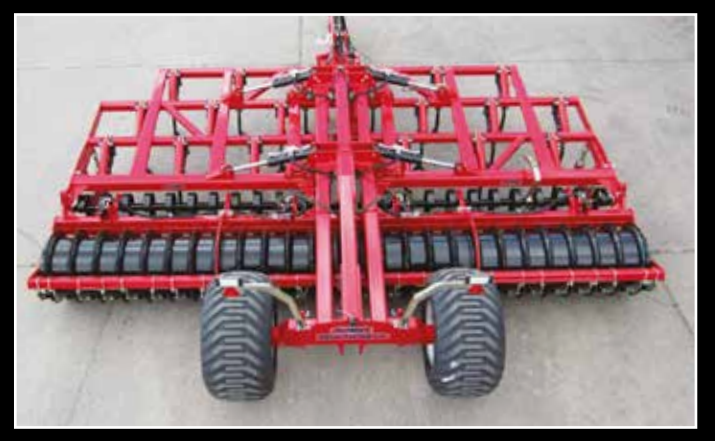
Consolidation is provided by the 609mm x 10mm Multipacka, featuring replaceable cast quadrants which crack and crush any remaining clods to leave a firm weather proof finish.