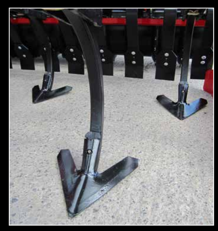
Featuring heavy duty spring loaded auto reset tines complete with 310mm wide, quick-fit points for a good mix in stubble cultivation, a narrow point is also available for working in ploughed land.